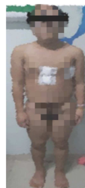
Figure 1. The appearance of hirsutism in patient.

A 14-year-old female was admitted to emergency room (ER) with chest pain. She felt chest pain all over the chest since 17 days prior to hospital admission that increased in 2 days. Chest pain felt like pressure. Pain worsened when she took a deep breath and improved with leaning forward. Fever, joint pain, cough and runny nose previously was denied. A week ago the parents noticed redness on both of her cheeks. The redness appeared suddenly and was not itchy nor related of cosmetics or facial creams. The stomach looked enlarged and felt bloated since 7 days ago. Hair loss was noticed since 1 week ago. History of canker sores or wound around mouth was denied.