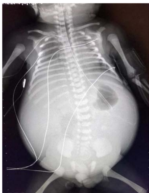
Figure 6. X-ray of the abdominal organs after birth.

The child was prepared for surgical treatment 3 hours after birth. The operation was carried out in the resuscitation and