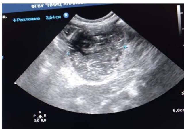
Figure 5. Ultrasound of the abdominal cavity after birth.