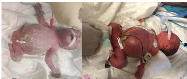
Figure 4. Appearance of a newborn G. at 1 minute after birth and 2 hours later (from left to right).

(according to the severity of the condition in a horizontal position): a significant increase in the volume of the abdominal cavity with a high standing of the domes of the diaphragm, a small amount of air in the stomach and the initial sections of the intestine, multiple calcifications in the abdominal cavity (Figure 6).