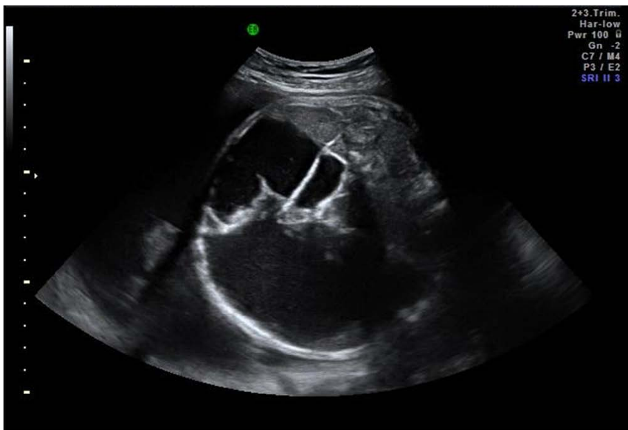
Figure 2. III screening ultrasound at 35 5/7 weeks of gestation.

There are no violations of the fetal-placental blood flow.