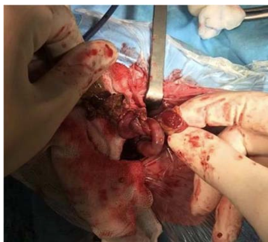
Figure 8. Volvulus of the atresized portion of the small intestine with perforation into the cyst cavity.