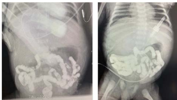
Figure 10. Contrasting of the disabled intestine on 01/08/2020 and 01/20/2020 (from left to right).

24.01.2020 - double enterostomy closure, entero-enteroanastomosis end-to-end.