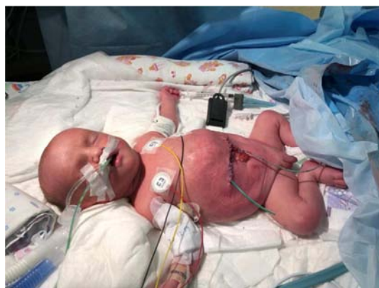
Figure 9. Appearance of the newborn G. immediately after surgery.

The postoperative period was without surgical complications, the child was in the intensive care unit. On the 4th postoperative day, he was extubated, on the 5th - without oxygen dependence. Nutrition was started from the 6th postoperative day in trophic volume with Alfara mixture with gradual expansion to 1/3 of the physiological volume through the horn. Partially enteral feeding was performed in the disconnected segment of the intestine.